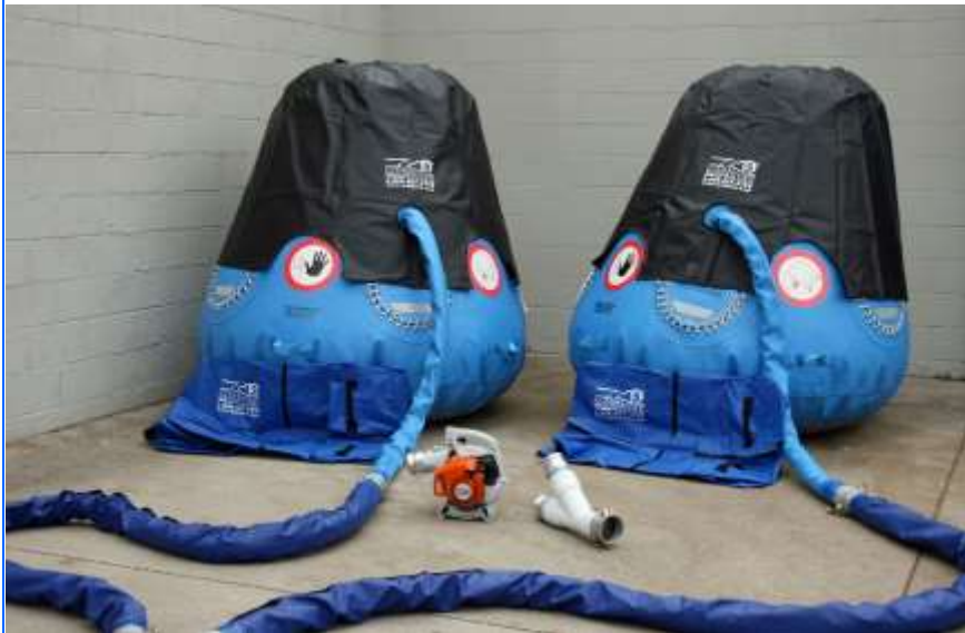
LANDING BAG TWO BAG SET PICTURED WITH OPTIONAL LANDING BAG COVERS