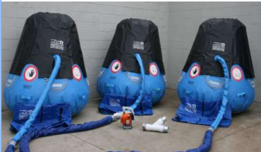
LANDING BAG THREE BAG SET PICTURED WITH OPTIONAL LANDING BAG COVERS